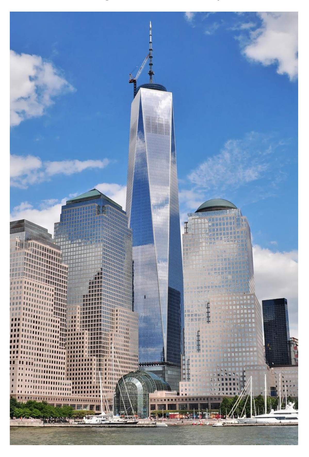
It's amazing. You have to see these places!