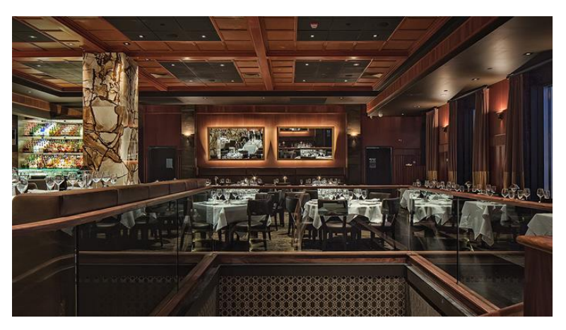
Mastro's is also a place where many celebrities have dinner.