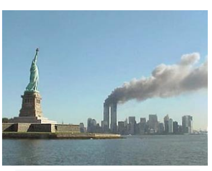
The Statue of Liberty on September 11, 2001 as the Twin Towers of the World Trade Center burn in the background