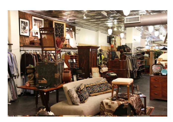
Manhattan 130 Crosby Street