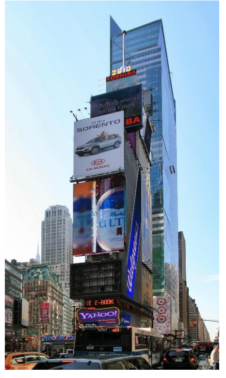
Until 1928 it was used as the headquarters of the "New York Times" newspaper.