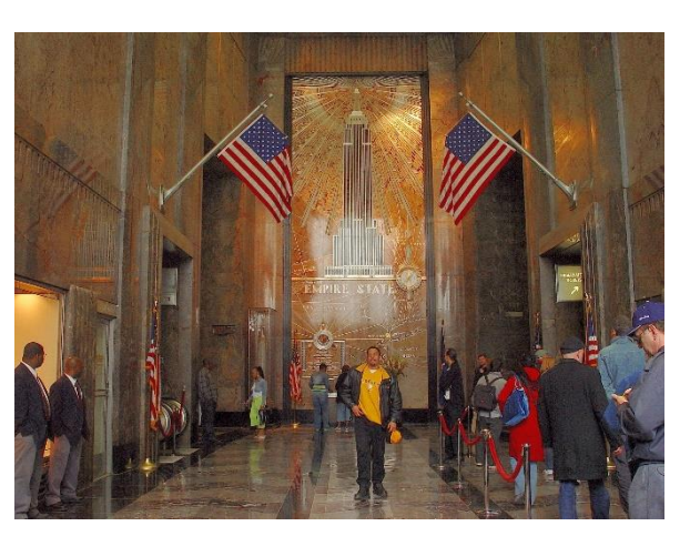
Inside the Empire State Building