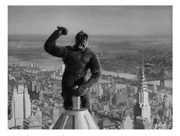
The ESB in the 1933 King Kong movie

The ESB is 443,2 metres tall and has 103 floors. The elevator just takes 50 seconds to the 86<sup>th</sup> floor. Inside the elevator is an e-wall where you can watch a movie about how the tower was constructed. The Empire State Building is so amazing that it appeared in about 90 movies from all over the world. The most famous one is King Kong. Inside the building up to 15.000 workers are employed and everyday 10 to 20.000 people enter the building, most of them being tourists. On a clear day you can see as far as 45 miles from the top.